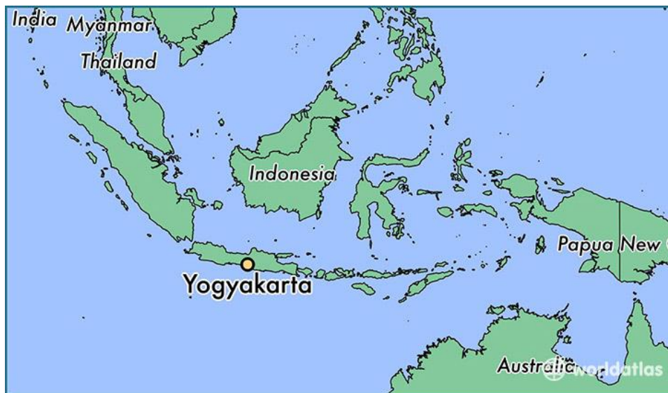
Figure 1. Yogyakarta Province in Indonesia

sector, or environmentalists, depending on the individual political economy objectives each wishes to achieve. Correspondingly, in the era of regional autonomy, the government has a political objective with reference to the environment as a target of commodification that can increase regional income. Likewise, in the case of Yogyakarta City (see Figure 1 and Figure 2 for the location), the establishment of malls/shopping centers and hotels is underpinned by this logic of business thinking. The hotel industry has been reported to contribute the highest revenue for Yogyakarta City, amounting to IDR 48,000,000,000 as compared to other sectors (Regional Council for Revenue Management, 2013). Furthermore, the number of hotels and rooms have experienced a dramatic increase. Also, data from the Tourism Department show that between 2010 and 2013 the growth of the number of hotels in Yogyakarta City was 116% (from 37 in 2010 to 84 in 2013) with 197.88% growth in occupancy rate (DIY Tourism Office, 2012; Hannigan, 1995).