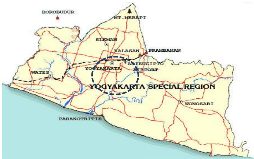
Figure 2. Yogyakarta City within Yogyakarta Province

government, with an evident lack of firm policy and legislation and also the government seemingly will allow expansive malls and commercial areas to be developed in the forthcoming months. In other words, the government is still oriented towards infrastructure development and reports from BPPD are admittedly surprising. Yogyakarta City has only 25 hectares of urban forest and this can only be found in the Gembiraloka Wildlife Sanctuary Area. Although according to Act No. 26 of 2007, Yogyakarta City must have a minimum of 30% green space of its total area, while the IKONOS satellite imagery in 2009 shockingly reveals that the City of Yogyakarta still fails to recognize 43.36% of the green space of the total area (Brontowiyono et al., 2011).