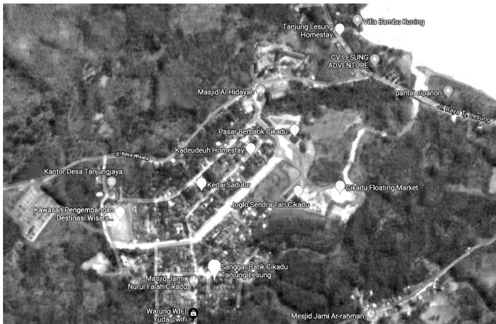
Figure 2. Aerial map of Kampung Cikadu

Actually, the initial tourism activity reportedly was the tourists been sent by Tanjung Lesung Resort to have additional activities outside the resort and to experience the wonderful river in Kampung Cikadu. Initially, the tourist activity went acceptably well. Until in recent months, there is one incident that leads to a tourist demise. Thus, the resort restrains its operation in sending the tourists to have activities in Kampung Cikadu. Nevertheless, the Batik Cikadu is still in demand to be visited by several tourists. Even though tourists from the resort are holding back for a while, but domestic tourists from other sources like government officials, schools, and corporate are quite many who visit Kampung Cikadu, mainly to visit the Batik Cikadu. In addition to that, according to the observation, it is indicated that the incident isn't the only factor that restrains tourists visit from the resort. From the tour operation point of view, there are several factors that need to be improved in order to keep the tourist from the resort visiting the hamlet.