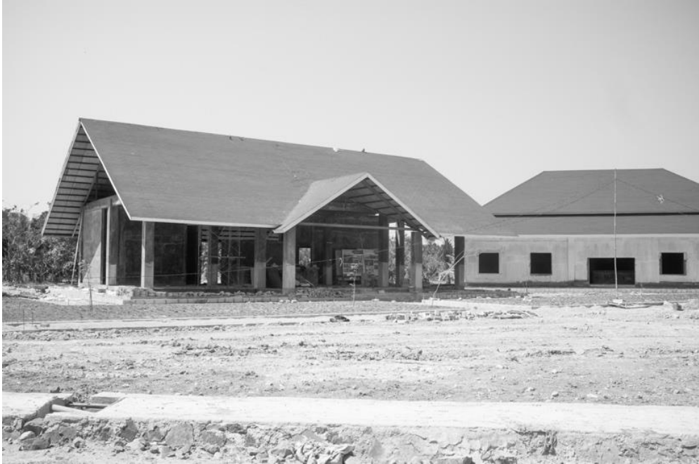
Figure 3. Modern Facilities Developed within the Hamlet