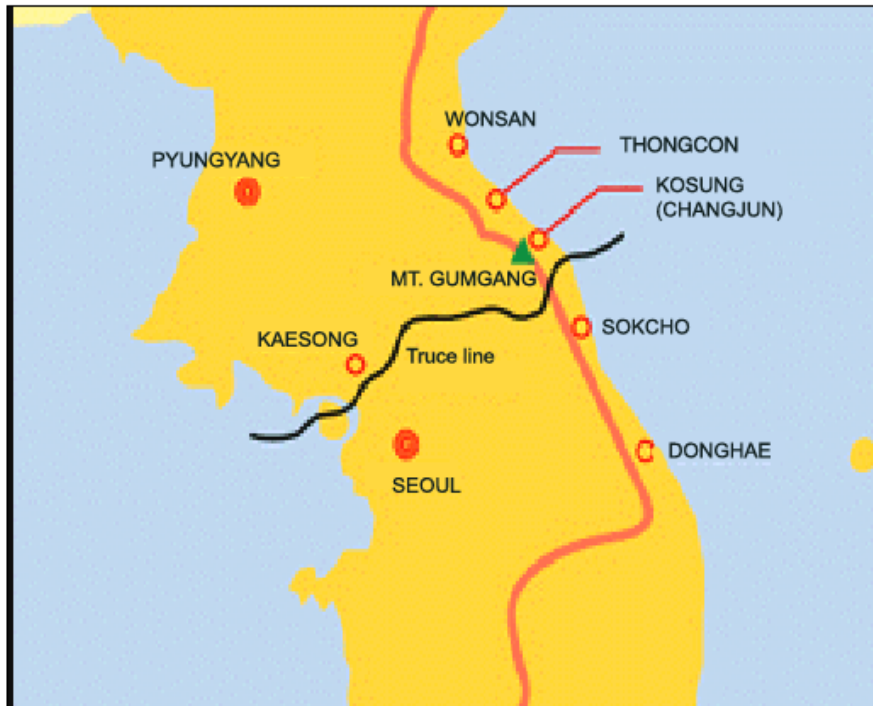
Figure 2 Mt. Gumgang

nearby Mt. Sorak in the South. The Mt. Gumgang project represents a landmark event, the first-ever joint project between the two Koreas in the tourism field. The project exemplifies the South Korean government's Sunshine Policy and the principle of separating politics from economics. In this sense, this project can continually contribute to the restoration of mutual confidence and development of common interests between the two Koreas.