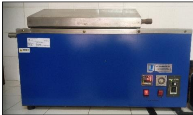
Figure 2 Water bath shaker.