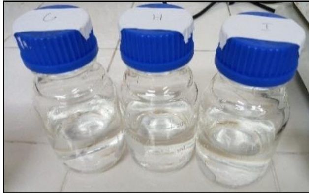
Figure 1 Experimental reactor bottles.

Glass bottles with a 150 ml working volume were used as experimental reactors (Figure 1). To maintain a constant and uniform temperature, the bottles were incubated at 26 °C in the water bath shaker (Figure 2).