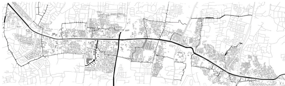
Figure 4. The fragmented road network of an emerging business corridor.

2005, there has been a minor alteration of the inner-spatial design of the TB Simatupang corridor. Primary road connections, as mentioned above, have triggered remarkable development of the front-road layer. However, this development was not followed by an improvement of secondary-arterial roads and secondary blocks behind the front layer. Figure 4 below illustrates the disconnection of the road network, particularly in the second block, as the corridor development was driven by private and disintegrated plot acquisition. The recent construction of MRT lines passing through the corridor has increased spatial fragmentation, as transit nodes are not well integrated. Despite the increasing number of functions and density in the TB Simatupang corridor, the spatial structure remains disintegrated and degraded.