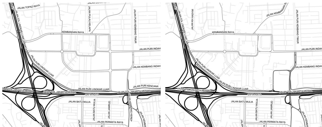
Figure 2. Fragmented road network in a premium enclave: the image on the left illustrates the road network as planned in Jakarta’s Detailed Spatial Plan (RDTR) of 2014. The image on the right shows the fragmentation of the network due to extensive land acquisition as opposed to the grid in the planning document.