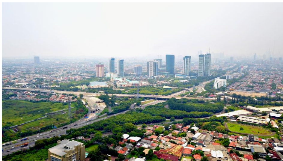
Figure 2. Puri CBD in West Jakarta, served by the ring road infrastructure.