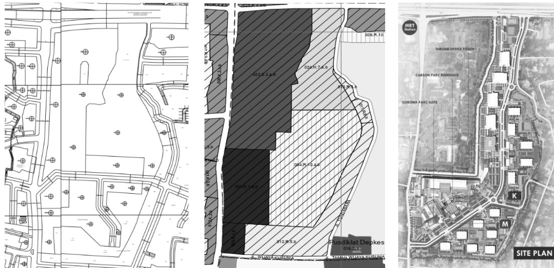
Figure 5a-c. Planning adjustment of the road network in a premium urban enclave.

Figure 5a illustrates the planning guidelines from 2005, in which the road network was planned to cut across the parcel, connecting it to the next lot. Figure 5b exemplifies the change in the Detailed Spatial Plan from 2014, where the connecting road network does not exist. Figure 5c illustrates the project's master plan in which the spatial structure is re-invented to support the commerciality of the project.