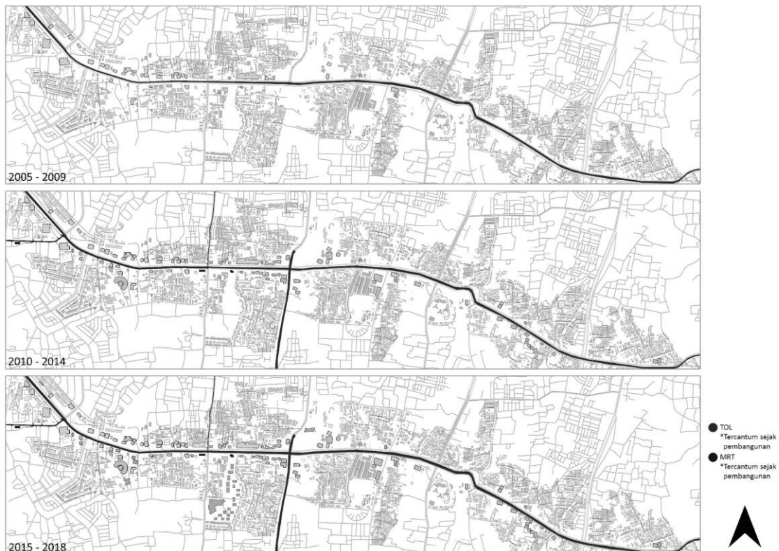
Figure 3. Temporal analysis of macro-connectivity and property development in the TB Simatupang corridor with the construction of the Depok–Antasari Toll Road.

The development trend of the TB Simatupang corridor can be traced back to as early as 1985, where most of the area was delineated for residential and low-density commercial development. Initially, the South Jakarta region with its higher elevation was planned as a water catchment area in order to avoid excessive runoff to the city. However, today's corridor has been transformed into a mix of commercial, service and high-density residential functions. Even in Jakarta's Detailed Spatial Plan (RDTR) from 2014, the southern part of the TB Simatupang corridor is no longer delineated as a green space and low-density residential area. The increasing connectivity has extended the transformation toward the Jakarta Outer Ring Road, which integrates the corridor with strategic functions in Jakarta, including airport, harbor and industrial estates. Significant infrastructure development in this corridor (toll road and MRT line) has triggered investment in large-scale real estate projects, including superblocs and office parks (see Figure 3). The planning documents also authorize the increase of building intensity, particularly in major property development. Fatmawati City, for example, was the first Transit Oriented Development area in Jakarta, with the allowable floor-area-ratio (FAR) increasing from 0.4 to 4.5 and the building-coverage-ratio (BCR) increasing from 5-20% to 5-55% in 2005 and the Detailed Spatial Plan from 2014.