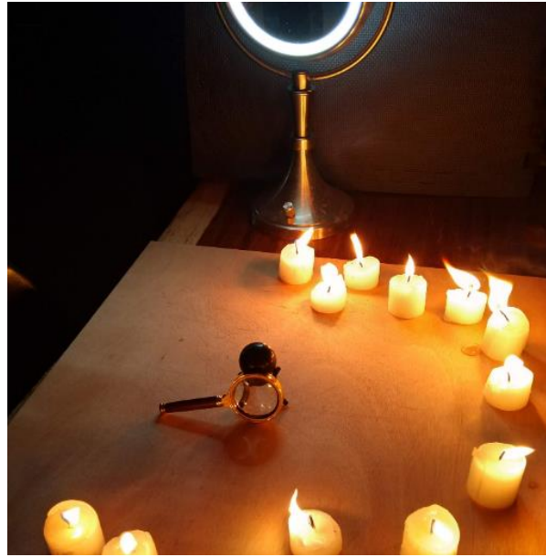
Figure 5 Visual report by participant D. Specialized knowledge is like a candle illuminating only a part of darkness.

He stated that candles represented specialized knowledge, which is only able to illuminate part of the field. Then, he declared that this composition was a representation of his thesis work, placing himself at the center aiming to understand an object of study, partialized of course, and bringing knowledge from other authors (the candles) to achieve it. The teacher brought to the class' attention that the candles also produce shadows. In other words, projecting light onto a particular area also casts a shadow over another area. Wanting to produce specialized knowledge on a particular subject could ignore essential aspects of a problem, producing a holographic image of the phenomena. When asked where he got so many candles, the student said that his wife had filmed a music video and they were lying around. Hence, the candles helped shaping his idea for the scene. The magnifier is not a common object. He remembered having it when thinking about the article. The idea for the scene began to take shape while he was looking for objects. Thus, even though he imagined the magnifier, visual awareness allowed him to iteratively think to incorporate other objects at hand and produce his statement.