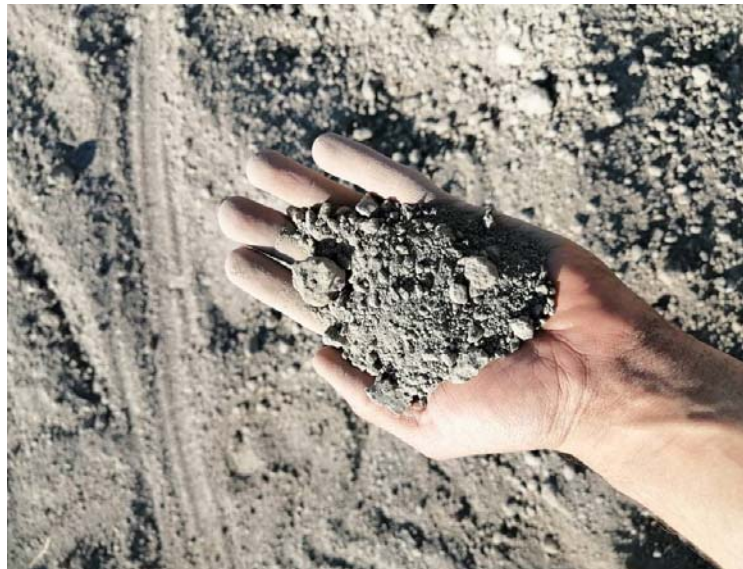
Figure 4 Visual report by participant C. Specialization is like looking at a handful of dirt.

Fridge magnets are a popular souvenir. The student probably looks at this object almost every day or at least every time he opens the refrigerator. However, when he became visually aware and started noticing his surroundings, he could convey new meaning to the objects at hand. The next time he passed the fridge or maybe opened it, a colorful object stood out, and he could reflect upon two things: the article and his own experience. Visual awareness allowed the student to link Ortega y Gasset's arguments to his own research experience. While looking for something to photograph, an idea was shaped through iterative thinking: that specialism is like being color-blind and this idea made him re-interpret his experience and understand it on a different level.