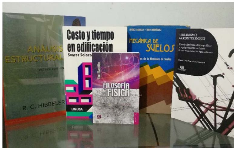
Figure 7 Visual report by participant F. Specialized research is necessary.

Without the visual report it could have been harder for the student to state as clearly his disagreement with the author's ideas. The titles of the books displayed in the picture also made his argument easy to understand to the rest of