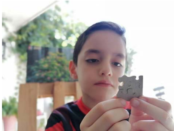
Figure 2 Visual report by participant A. Specialization is like a puzzle.

Practicing visual awareness was evident in this case. The student began looking for objects to photograph in his home, while at the same time thinking about the article. Going from one object to another, he began trying to see how each one could represent a relatable idea until he found something that clicked. Puzzles are probably one of the most popular games to play at home, with children, during confinement. This everyday object acquired new meaning when he was visually aware of it. Also, he could appropriate the knowledge in the article by associating it with something close to him.