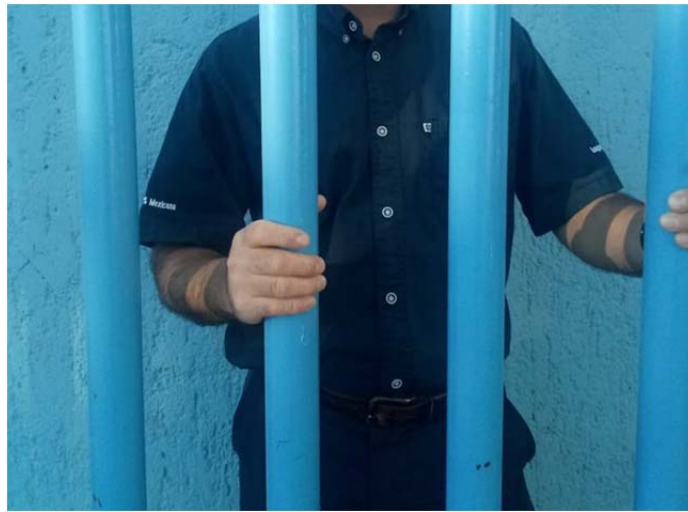
Figure 6 Visual report by participant E. Isolation is a consequence of specialization.

visual report, showing an isolated person, she also wanted to represent physical barriers such as disciplinary frontiers. While looking at the image, the teacher brought to the discussion the concept of 'porous frontier', stating that interdisciplinary dialogue does not necessarily mean bringing down the frontiers, but allowing dialogue, cooperation, and exchanging methods, information and findings. The visual report showed a porous frontier, although this was not the student's intention. You could talk to the person in the photograph, give him or receive something from him, even though he is isolated.