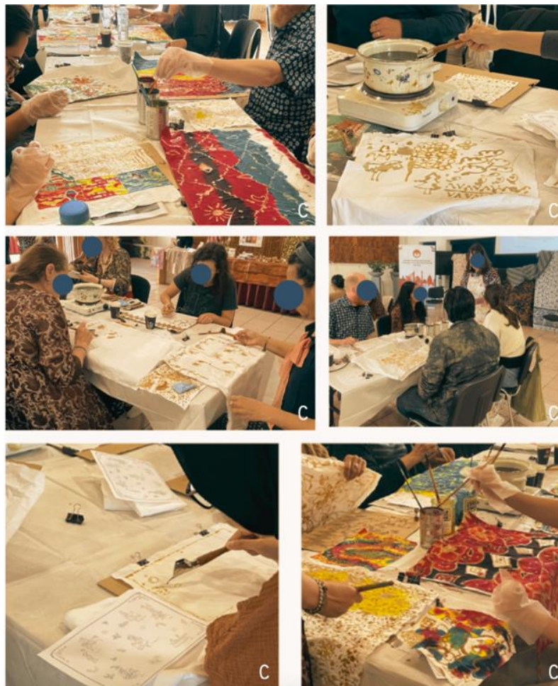
Figure 2 Surroundings of the workshop (C) Participants immersed in the creative practice through the batik and colet process.

Despite encountering difficulties, the participants remained focused and relaxed during the workshop. They appeared to be having enjoyable moments while creating batik. The hands-on experience as part of the workshop mechanism fostered a strong connection between the participants and the heritage object, promoting focus and joy.