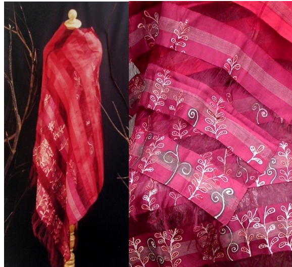
Figure 8 An example of non-traditional textile work by Mia Megasari. The materials used are pineapple fiber and sapan wood/dark red dyewood ( Caesalpinia sappan L ) natural dye.