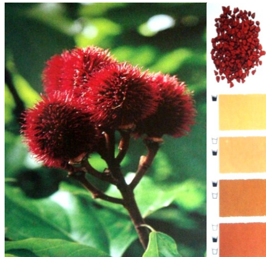
Figure 5 KESUMBA/GALINGGEM ( Bixa orellana ) [1] and its variation of colors.