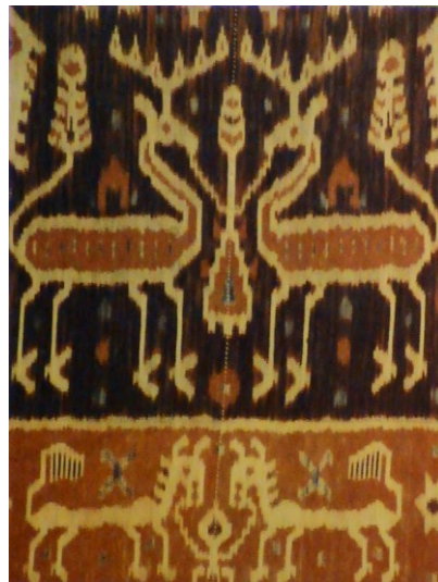
Figure 3 Hinggi Kombu (detail) from East Sumba, with the characteristic red from mengkudu roots [4].

Nevertheless, the optimism in using natural coloring matters is recently awakening. This tendency grows along with the issues of awareness of nature and the soaring popularity of back-to-nature lifestyle, which seem to counteract the issue of global warming. The awareness in using environmentally friendly products is currently increasing, causing the emergence of products labeled green design, green product, eco-labeling, eco-fashions, and several others. The