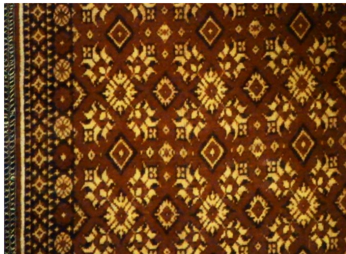
Figure 7 An example of traditional fabric using natural dyes: Geringsing Cecempaka Retang . The fabric is made of brownish red and pale yellow cotton threads. The ornaments used are double ties with floral, spiraling leaf, and champaca flower patterns, interspersed by star shapes and other geometrical lines. Geringsing in the pangur gigi (teeth filing) ritual is considered having a magical power, especially to repel bad luck during the ritual [4].