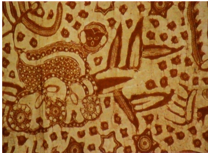
Figure 1 Another detail of a coastal batik sarong, from Lasem . The natural red dye is taken from the roots of mengkudu/noni ( Morinda Cirifolia ) or, in Sundanese , pace . Repeated dyeing for the desired colors causes the dye to be absorbed through the small cracks in the blocking wax. This process results in the lines or spots that wholly enrich the motif [2].

The advent of synthetic dyes in Indonesia in the 1930s rendered the natural dyes obsolete. The process of batik production which had usually involved natural dyes, such as soga , indigo, and mengkudu roots, began to utilize synthetic dyes, such as naftol , indigosol , and rapid, direct, and reactive. In the following decades, textile producers using natural dyes were a rarity.