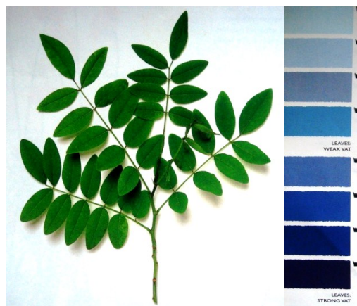
Figure 4 INDIGO/TARUM ( Indigofera tinctoria ) and its variation of colors [1].