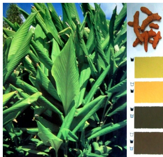
Figure 6 KUNIR ( Curcuma domestica ) and its variation of colors [1].