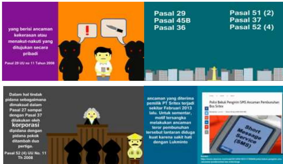
Figure 2 Results of Assembly

that the animation becomes more interesting. The following are some of the animation displays as the result from the assembly stage: